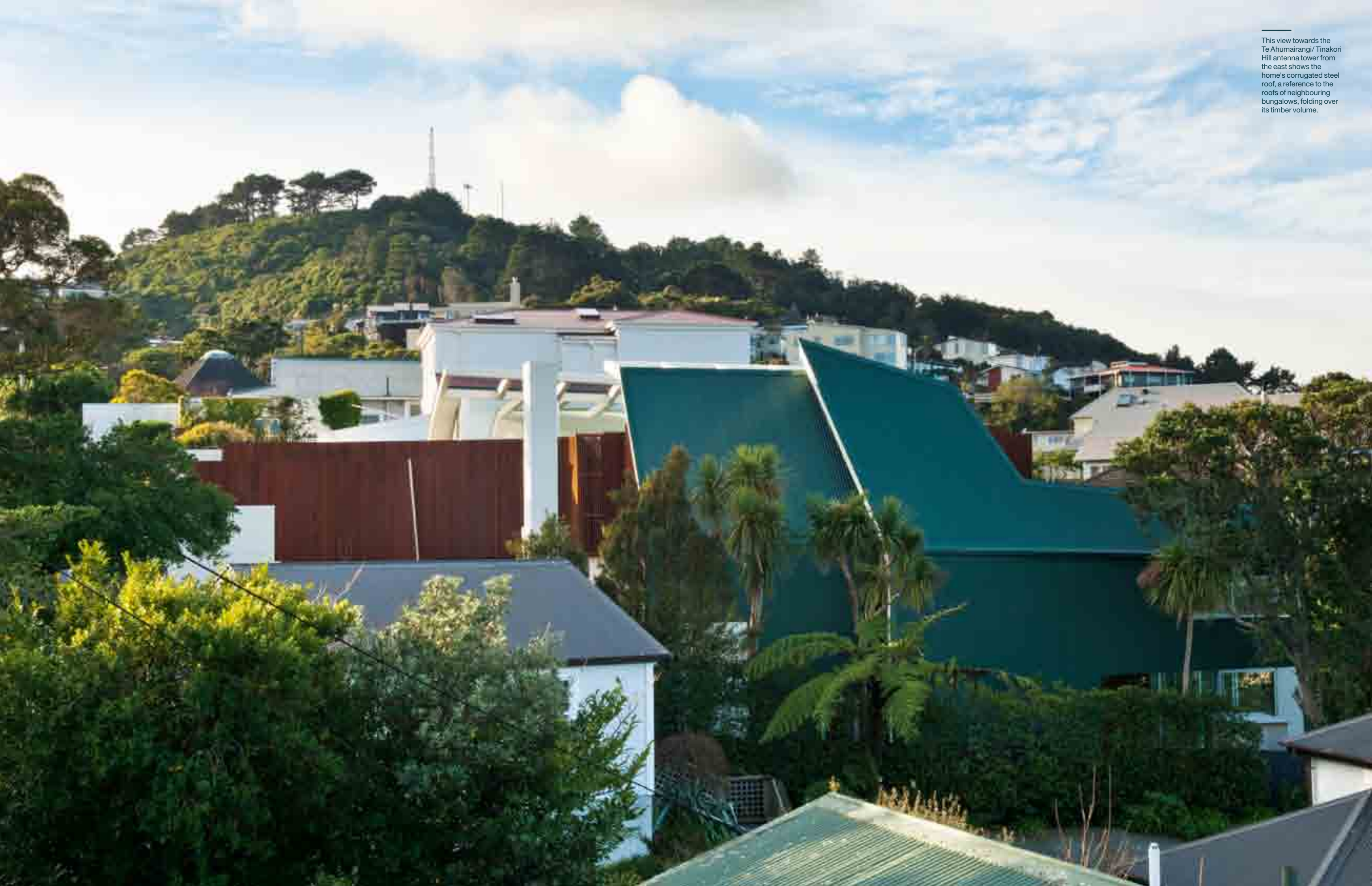
This view towards the Te Ahumairangi/ Tinakori Hill antenna tower from the east shows the home's corrugated steel roof, a reference to the roofs of neighbouring bungalows, folding over its timber volume.